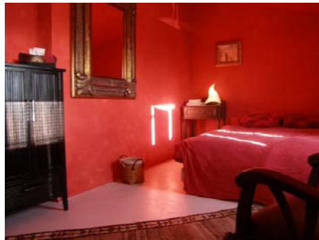
RED ROOM WITH VIEW FROM WINDOW, TOWARDS THE COAST, AT SUNRISE