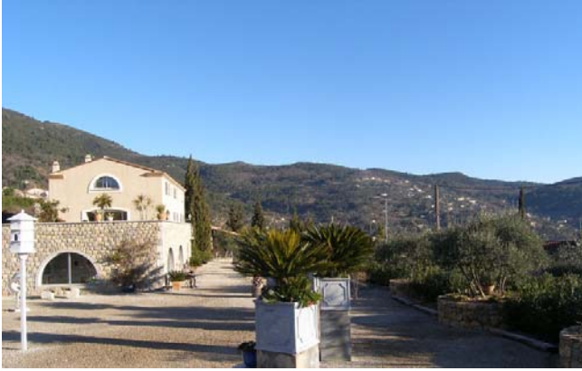
THE ORANGE TREE GALERIE, SEILLANS